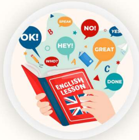
SPOKEN ENGLISH AND SOFT SKILLS