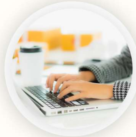
EDITING FOR PUBLISHING